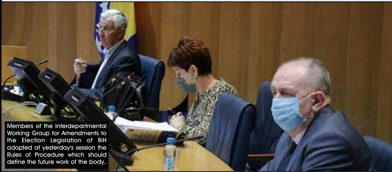
Members of the Interdepartmental Working Group for Amendments to the Election Legislation of BiH adopted at yesterday's session the Rules of Procedure which should define the future work of the body.