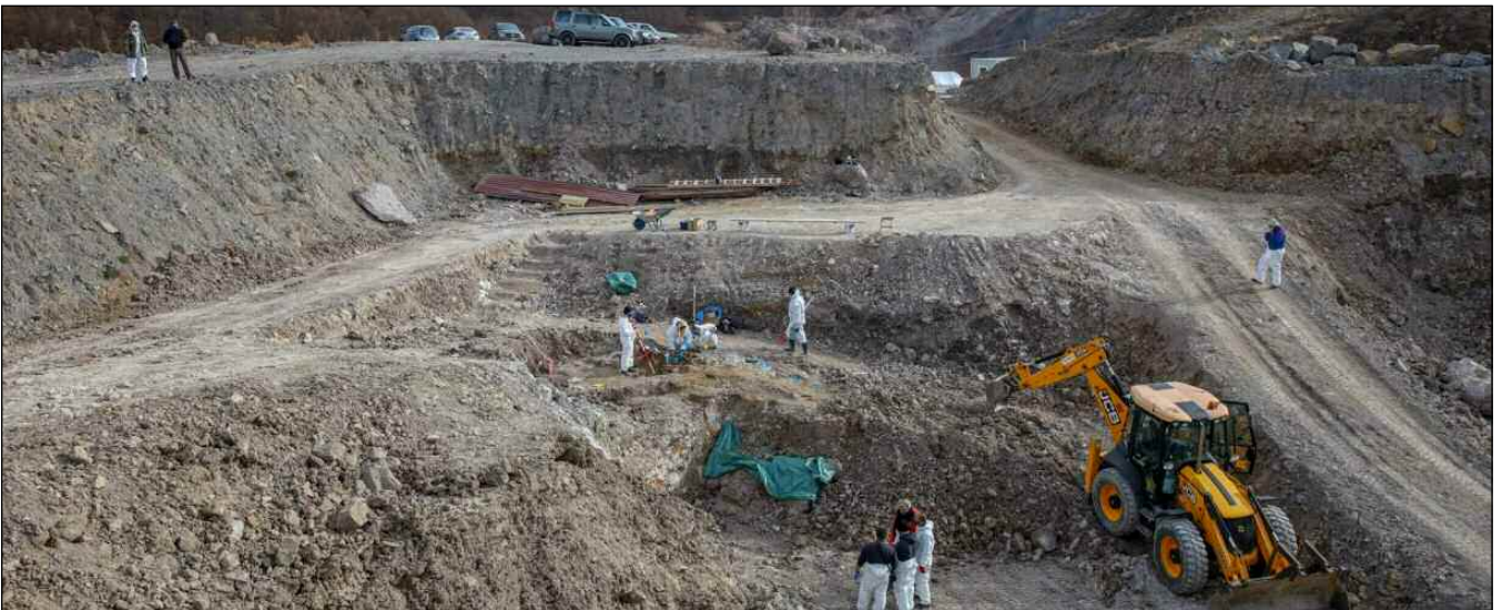
The Kizevak mass grave

Missing persons officials from Serbia and Kosovo on Wednesday announced the completion of exhumation work at the former Kizevak open-cast mine, near the town of Raska, where victims' bodies from the Kosovo war have been found.