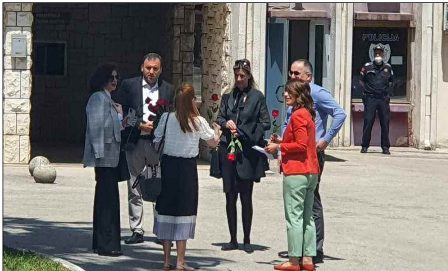
Activists and Interior Ministry representatives at the commemoration in Herceg Novi

Nine former policemen indicted for the deportations were acquitted in November 2012 because the court ruled that while the arrests were illegal, they did not constitute a war crime and