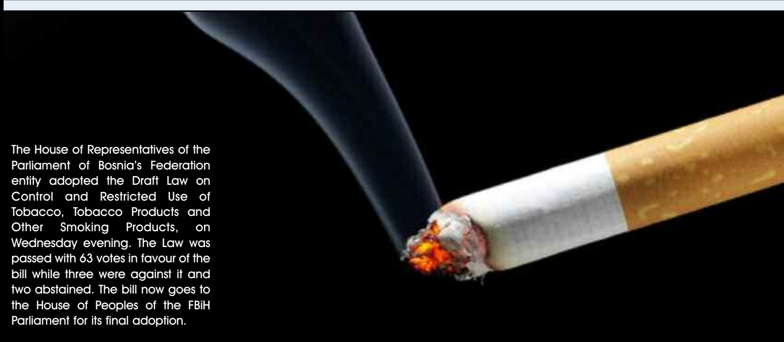
The House of Representatives of the Parliament of Bosnia's Federation entity adopted the Draft Law on Control and Restricted Use of Tobacco, Tobacco Products and Other Smoking Products, on Wednesday evening. The Law was passed with 63 votes in favour of the bill while three were against it and two abstained. The bill now goes to the House of Peoples of the FBiH Parliament for its final adoption.