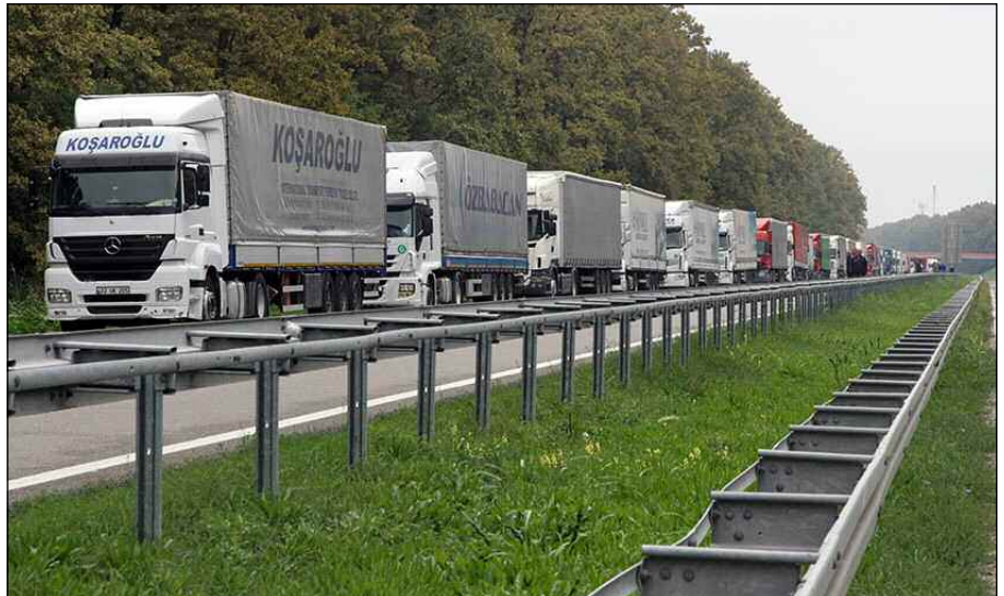
Lots of losses

Associations of businessmen in BiH have already confirmed the losses of Bosnian exporters in hundreds of thousands of